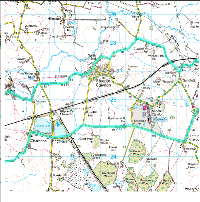
-2 & 4-